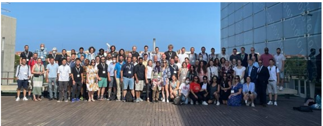
WNU SI 2022

It has been a dark time for us all. Crisis after crisis – pandemic, war, inflation and economic uncertainty, political upheaval. It has been easy to have a negative outlook. No sooner does it appear that one major world event is finally in the rear-view mirror than the next one takes hold.